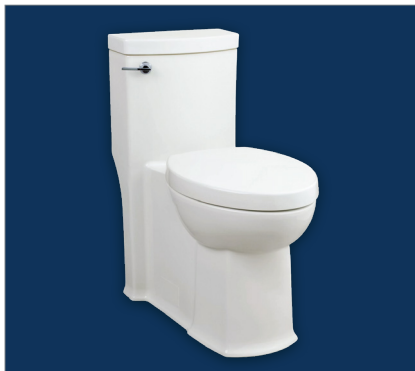
One-Piece Concealed Trap Toilet