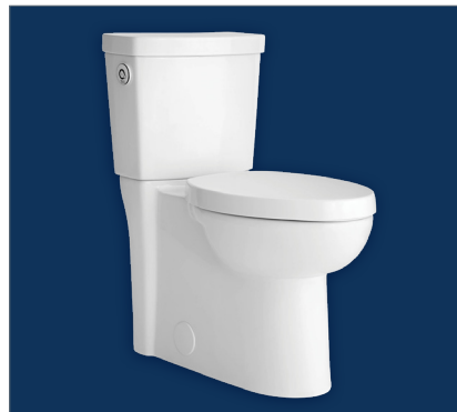
Two-Piece Concealed Trap Toilet

The Bemis bidet seats are equipped with Stay-Tite® and therefore will require an alternative top mounting kit which can be specified at the time of purchase, or as part of our post-sales support team. Please contact seats.orders@bemismfg.com to receive alternative installation kit.