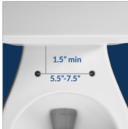
Toilet Compatibility Measurements