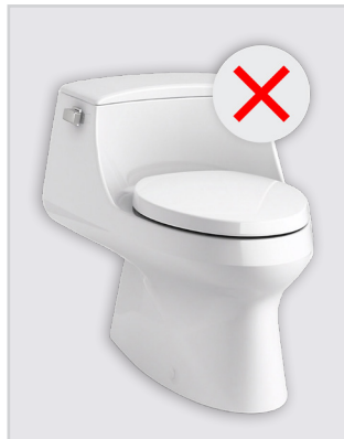
One-Piece with French Curve